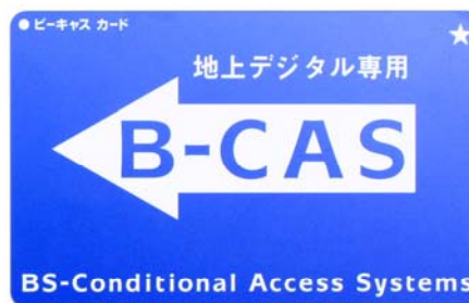
PIX-XT041-ZZ0 compared with B-CAS Card